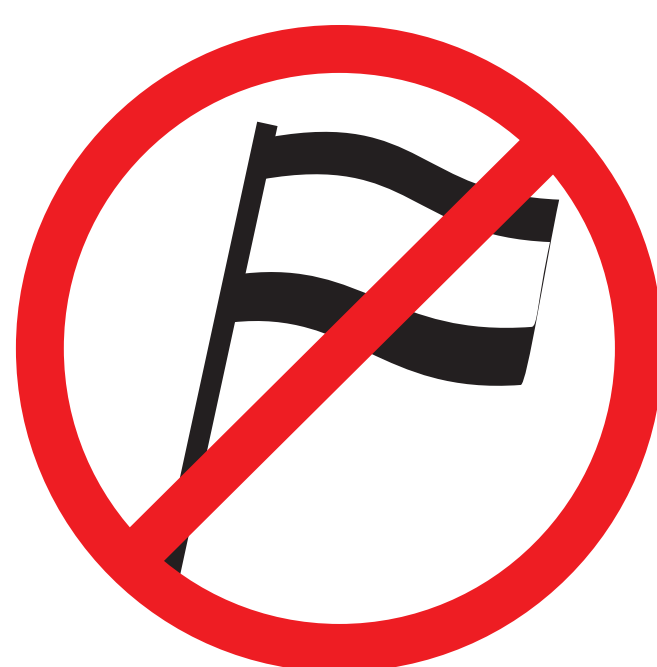
Flags or sign poles which are longer than 1.5 m or have a diameter of more than 3 cm.