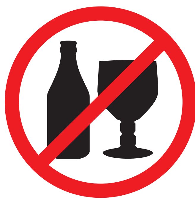
Glass, metal containers or bottles, alcoholic or non-alcoholic beverages