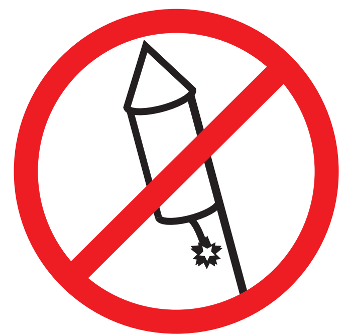
Rockets, flares, sparklers, Bengali fireworks, smoking powder.