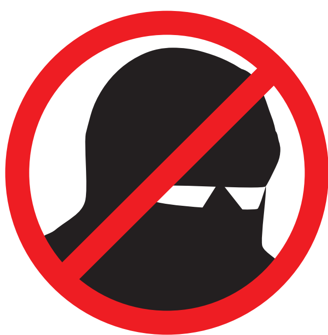
Ban on wearing masks