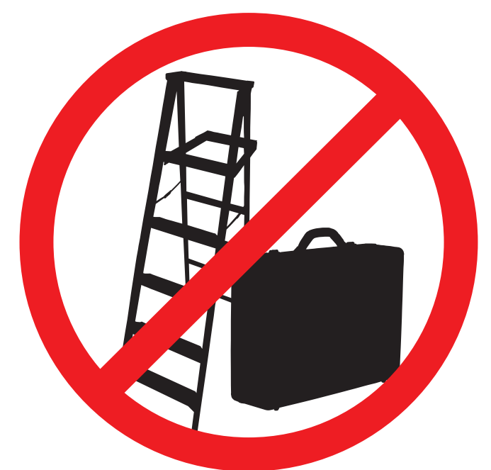
Cases, crates, chairs, stools, ladders