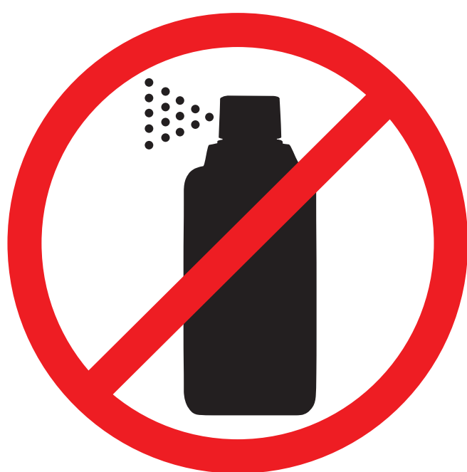
Gas spray cans