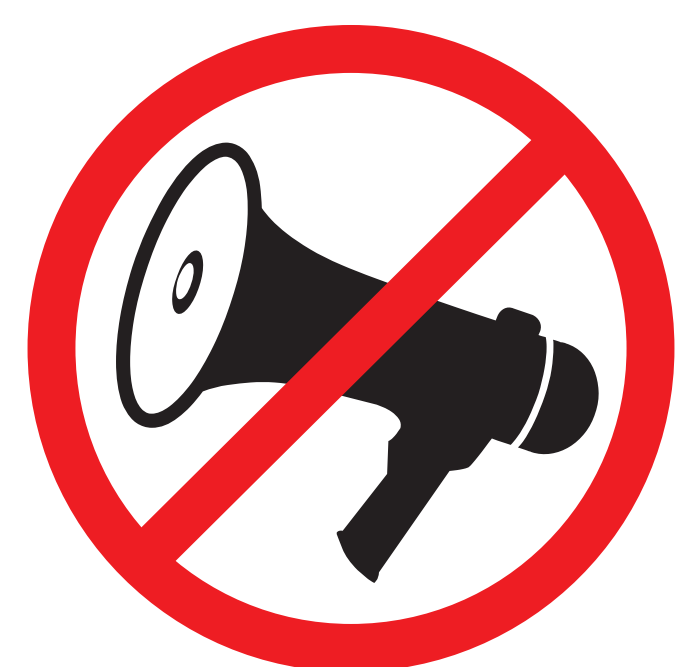
Mechanical or electronic noisemakers, air horns