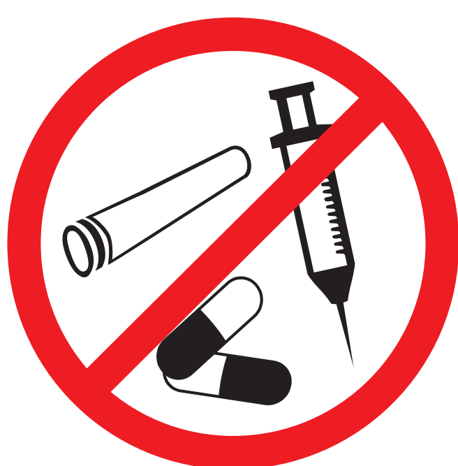
Drugs of any kind